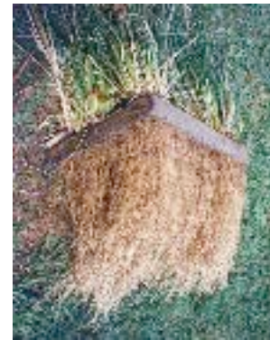
Figure 3. Root length of 780 mm after three months growth on effluent. (Dr. Paul Truong)

Figure 3 shows vetiver grass that was grown hydroponically on a wastewater effluent in tropical Australia in an experiment to assess nutrient removal ability. The most common method of treating industrial wastewater in Queensland is by land irrigation of tropical and subtropical pasture plants. A series of research projects conducted at a gelatin factory and at an abattoir determined that vetiver grass was superior to pasture grasses used for wastewater disposal. 3 Vetiver grass has the potential to produce up to 132 tonnes per hectare per year (t/ha/year) of dry matter compared to 23 and 20 t/ha/year for Kikuyu and Rhodes grass respectively. This production level of vetiver can export up to 1,920 kg/ha/year of N (nitrogen) and 198 kg/ha/year of P (phosphorus), compared to 687 of N and 77 kg/ha/year of P for Kikuyu and 399 of N and 26 of P for Rhodes grass respectively. Vetiver growth can respond positively to a supply of N up to 6,000 kg/ha/year, and, to ensure this extraordinary growth and uptake of N, the P supply level should be at 250 kg/ha/year. 2